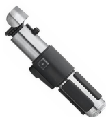
Jedi Master Yoda's Lightsaber Hilt