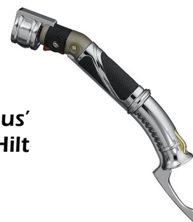
Darth Tyrannus' Lightsaber Hilt