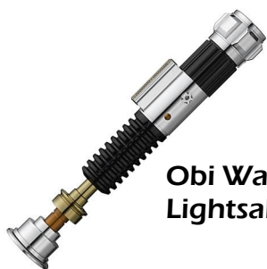
Obi Wan Kenobi's Lightsaber Hilt